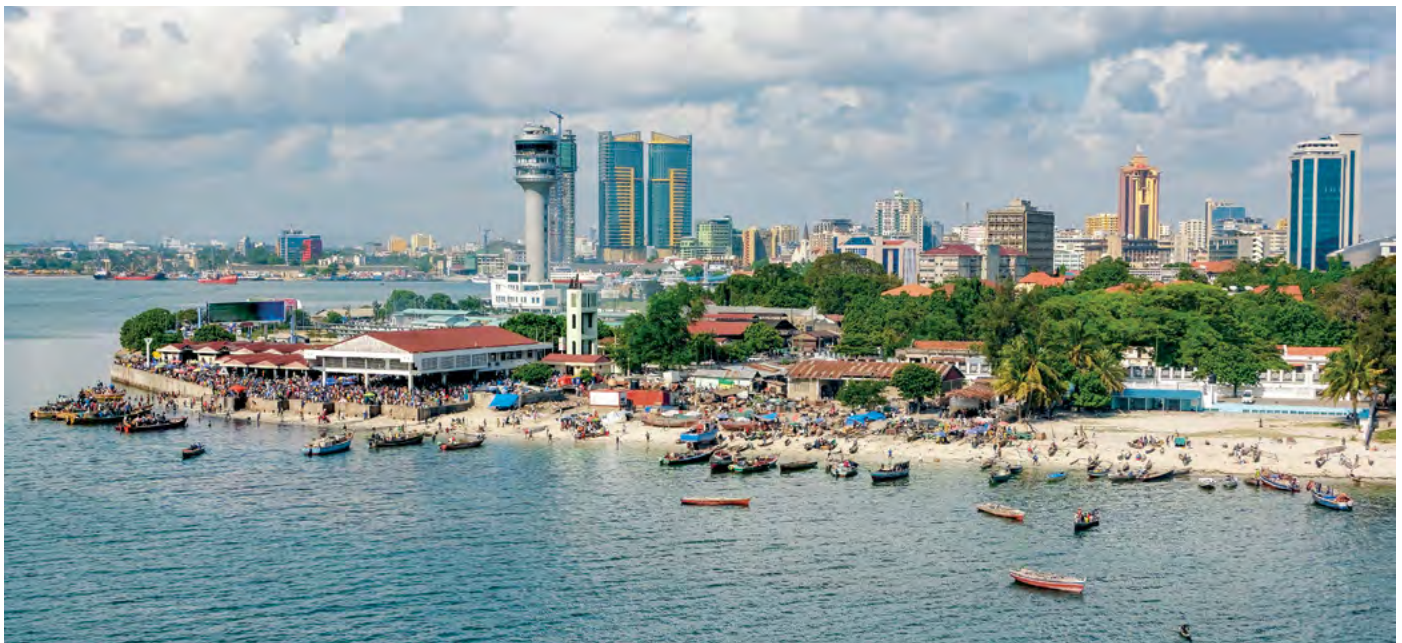
Fisherman boats in front of Kivukoni fish market with Port control tower and Skyscrapers Behind, Dar Es Salaam, Tanzania

Finally, implementation of ORSA, stress testing and risk-based capital in a number of select jurisdictions, one in the EAC, another developing country in Africa and finally Canada, bearing in mind that Canada's implementation of these areas is viewed in an aspirational manner only. I was also able to use knowledge gained from working on risk-based capital, risk-based