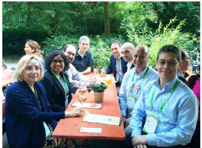
ICA attendees gather for a casual dinner.