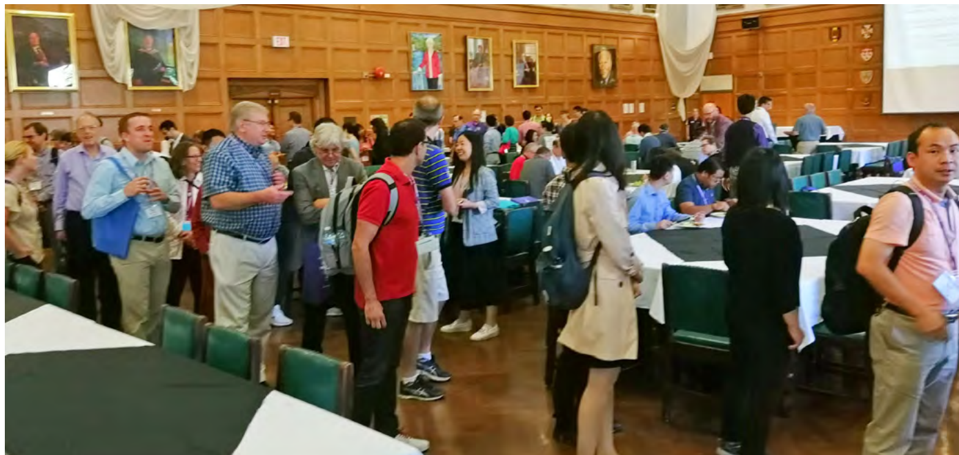
ARC attendees gather for lunch in the Great Hall at Somerville House on the Western University campus.