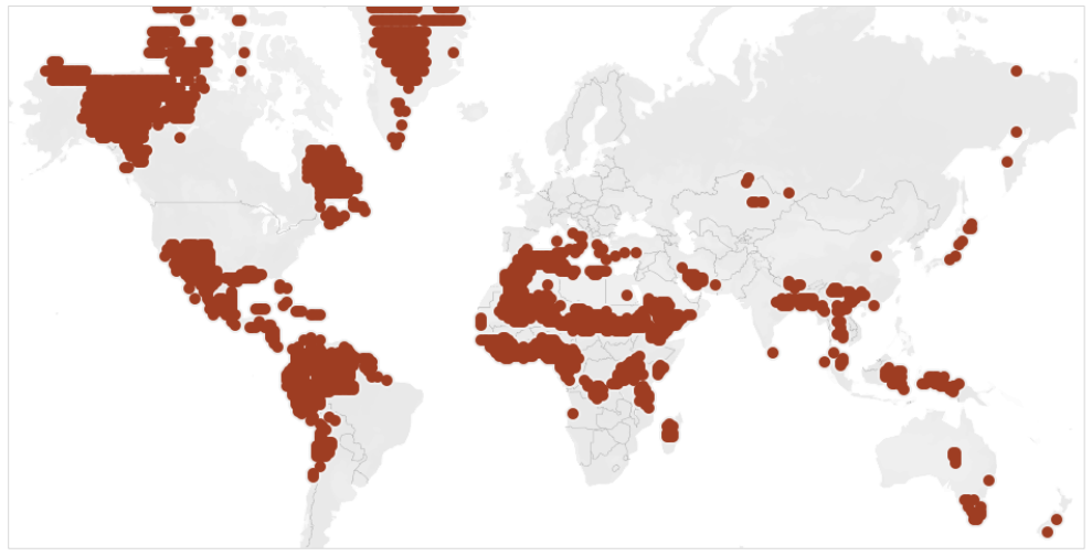
Figure 3 LOCATIONS FOR WHICH THE JULY 2023 MEAN TEMPERATURE WAS A RECORD-HIGH

To focus on those locations with unusually high temperatures, each map is outfitted with a user-controlled filter. For example, map 1 has a filter that restricts the range of percentiles that are displayed. Figure 3 was generated by setting this filter such that only those grid points with record-high temperatures are displayed: